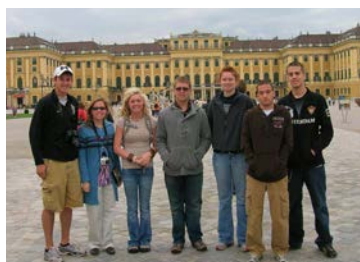
Schönbrunn Palace, Vienna, Austria