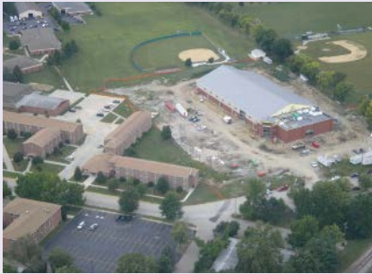
Aerial shot of the new Lincoln Center under construction