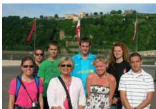
At the Rhine River in Germany

This year's Global Studies program offers travel to Athens, the Greek Islands, and Istanbul, Turkey. Students receive one-hour of elective Global Studies credit for participating in these programs. If you are interested in traveling with Lincoln College, please contact Professor Knopp at pknopp@lincolncollege.edu or (217) 735-5050 ext. 304.