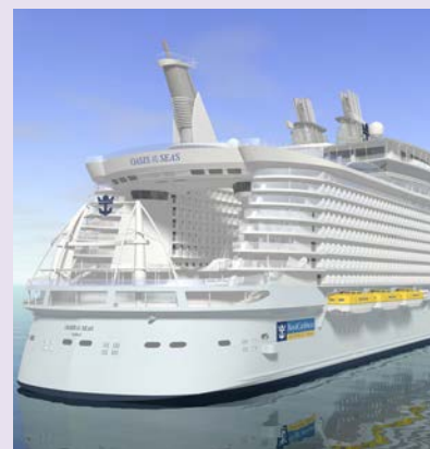
Royal Caribbean's Oasis of the Seas