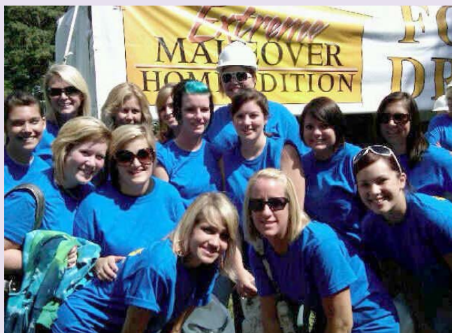
MCC students on-site at Philo, Ill. Extreme Home Makeover Edition