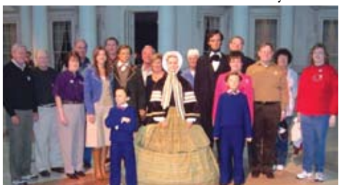
A group from Reunion 2006 tour the Abraham Lincoln Presidential Museum in Springfield, IL.

ATTENTION ALL LINCOLN COLLEGE STUDENTS Mark your calendar for Reunion 2007. Friday, April 27 through Sunday, April 29, Lincoln College will celebrate reunion years for all members who are a part of classes ending in a 2 or 7. So, come back to campus classes of 1932, 1937, 1942, 1947, 1952, 1957, 1962, 1967, 1972, 1977, 1982, 1987, 1992, 1997, and 2002. Don't worry, if this isn't your anniversary year, you can still come to reminisce and relive the memories. Members of all graduating classes will be recognized during the Alumni Dinner and Awards Program on Saturday, April 29. Individuals in attendance who are celebrating their 25th or 50th reunion will receive the Swarovski crystal Lincoln College Alumni pin.