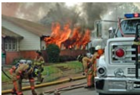
Lincoln College's maintenance building is engulfed in flames as area firefighters continue to work.

Lincoln College's maintenance building on North Ottawa Street, which once served as the campus dining hall, burned to the ground Sunday, October 10, 2004, despite area firefighters' efforts to extinguish the flames. No one was directly injured, although some firefighters suffered minor injuries. Forty firefighters battled the blaze for over two hours before the flames were entirely contained. Due to the delayed reporting of the fire and the type and quantity of chemicals stored in