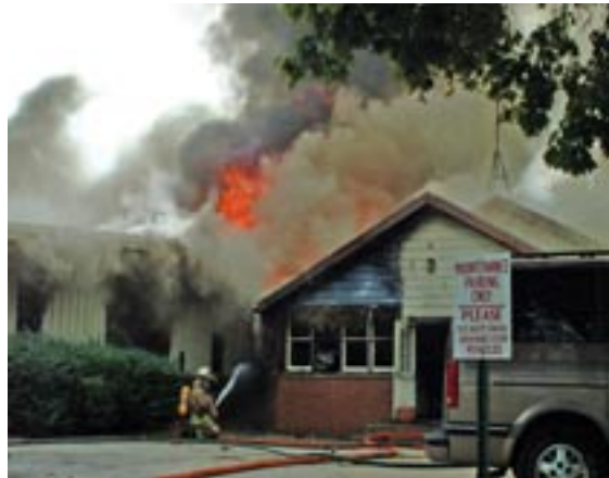
Flames and black smoke roll from the center of the Lincoln College maintenance building.

said Craig. The LC Maintenance staff has been busy relocating cleaning and maintenance supplies to the building and grounds department. "We moved a 6,000-square-foot building into a building that was already occupied," said Craig.