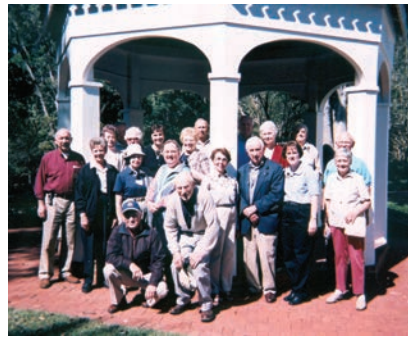
The Lincoln College group pose for a picture at The Elms during the Natchez 2003 trip.