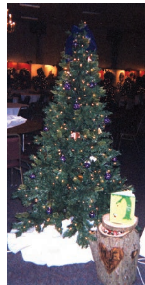
This year's Lincoln College sponsored tree at Baby Fold's Festival of Trees.

land with one-of-a-kind, beautifully decorated Christmas trees. Corporate sponsorships, generous donations, and the volunteer efforts of hundreds of individuals make the annual event possible.