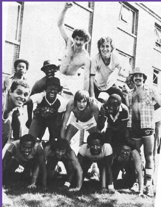
Guys who lived in Forsythe in 1979.

If you have news to share, please fill out the form located on the inserted envelope flap, and send it to us. We encourage you to send photographs (non-returnable). If you would like to send the information via e-mail, send it to: jamiller@lincolncollege.com Class notes can also be sent via the alumni web page. Go to www.lincolncollege.edu/alumni .