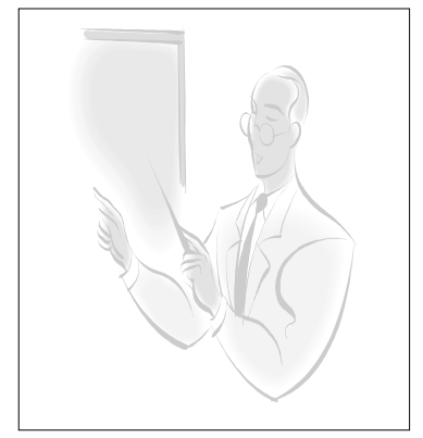
Lincoln College Faculty